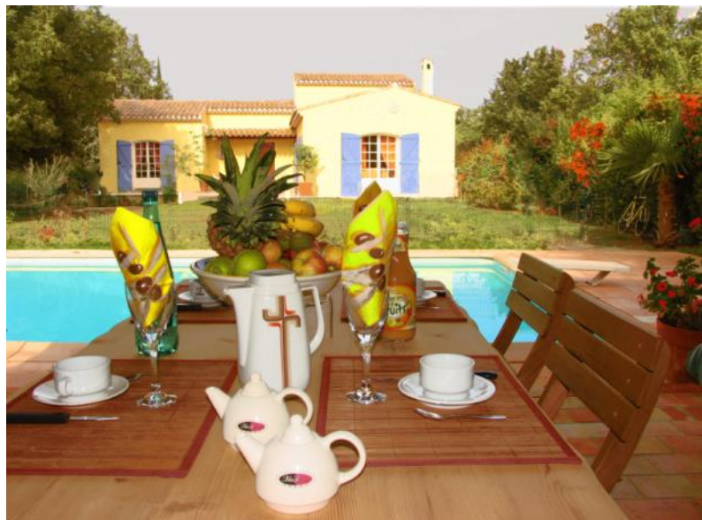
The villa & pool house